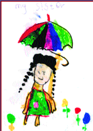
Kavindi Sugathadasa (4 years)