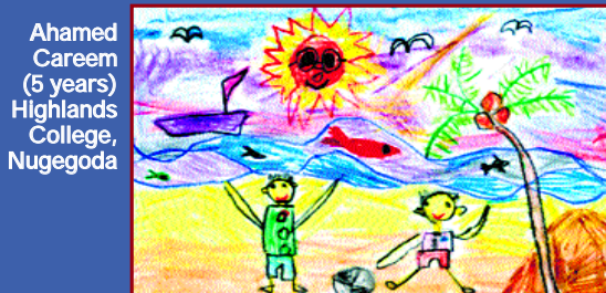
Ahamed Careem (5 years) Highlands College, Nugegoda