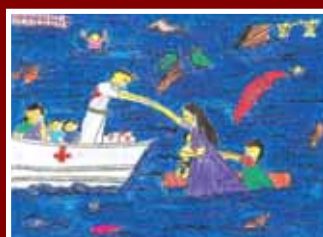
Thamali Kumari Pushpadana Girls College, Kandy