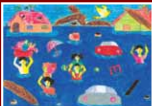
Shewuri Pinto Thihariya Islamic International School