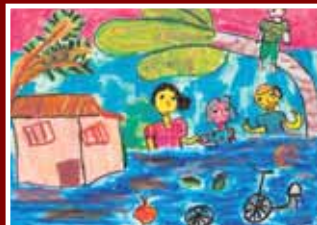
Gayara Randini Southlands College, Galle