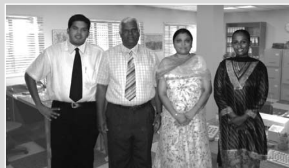
CDC staff at the opening of the CDC Branch office in India

CDC-marking the future of migration consultancy!