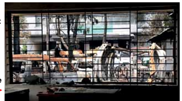
Dhaka, Bangladesh Burnt vehicles inside a government premises after protests in Dhaka. The government has imposed a nationwide curfew and deployed military forces after violence broke out in Dhaka and other regions following student-led protests demanding changes to the government's job quota system.