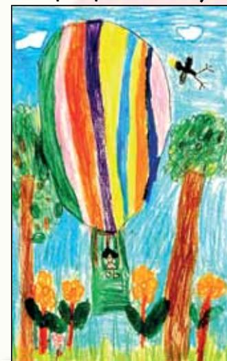
Netana Krause (5 years) Ladies' College, Colombo