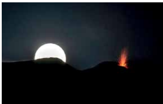
Maletto, Italy The 'deer moon' rises in the Voragine crater of Mount Etna. The full moon in July is known as the deer moon, a definition derived from the Native American tribe of the Algonquins, and a reference to the maximum development of male deer antlers.