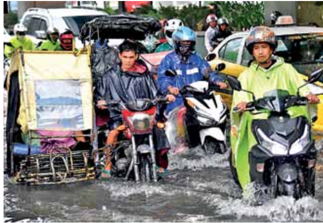
Manila, Philippines Motorcyclists ride through a flooded street in Manila amid heavy rains brought about by Typhoon Gaemi.