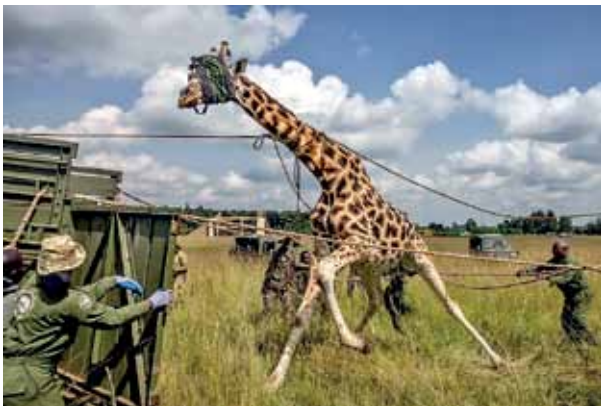
Eldoret, Kenya Members of the Kenya Wildlife Service try to control a giraffe that has been tranquillised and blindfolded during a translocation exercise for wild giraffes in a farm near Eldoret. In western Kenya, wild giraffes are being relocated to the Ruko Conservancy to keep fostering peace between the historically clashing Pokot and Ilchamus communities.