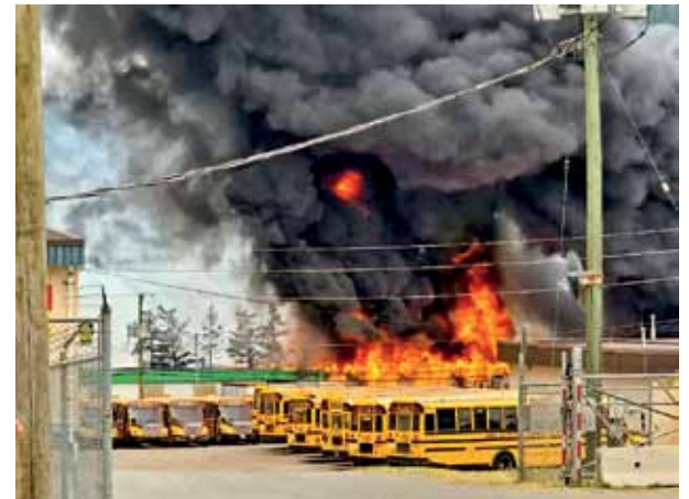
Williams Lake, Canada Smoke and flames rise from a wildfire burning on the edge of the Cariboo region city of Williams Lake in British Columbia.