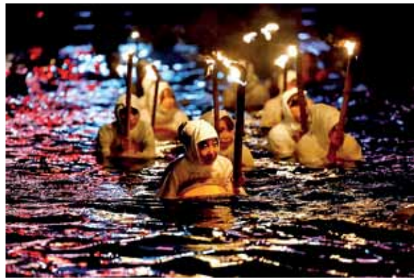
Minamiboso, Japan Sea-diving fisherpeople pray for an abundant catch in a traditional ceremony held by female free divers in Chiba prefecture.