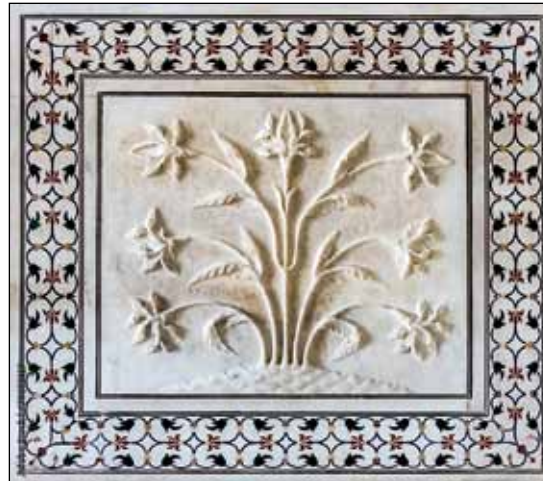
Marble inlay of Taj Mahal