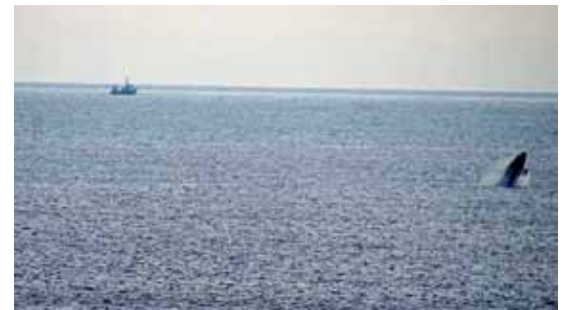
The whale has been observed near Killybegs in County Donegal.

"As with all whales, they have full protection under Irish law... this is our chance to help a population of whales on the very brink. "Please give it space."