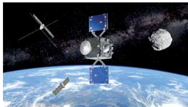
This is what Ramses – ESA's asteroid-following machine – could look like.

It was hoped that if the mission was a success, then if an asteroid ever did come close to Earth, they could redirect it. And luckily, it was successful.