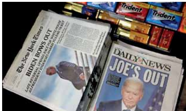
New York, USA Copies of newspapers on sale the day after President Biden announced he would drop his re-election bid.