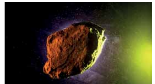
An asteroid is a big chunk of rock that floats through space, orbiting the Sun.

The ESA wants to make the most of the asteroid being so close by.