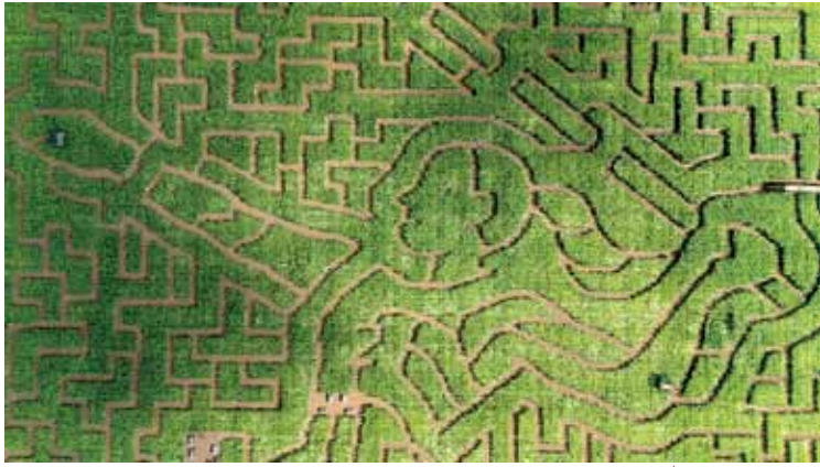
Wistow, England Wistow Maze is designed to represent heptathlete Katarina Johnson-Thompson in the pose of throwing a javelin before the Olympic Games in Paris.