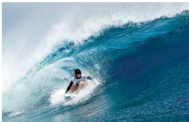
Teahupo'o, Tahiti Australian surfer Molly Picklum trains for the Paris Olympic Games.