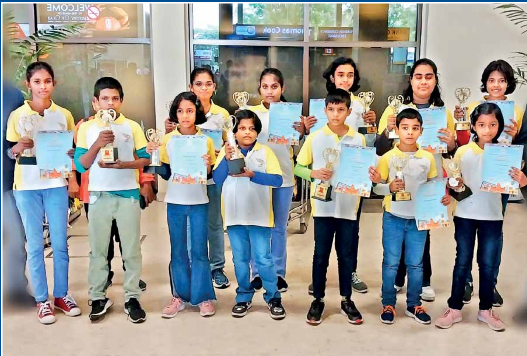
Abacus Olympiad Winners