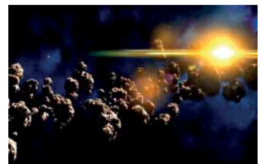
Asteroids are sometimes found in one area together, which is known as an Asteroid Belt.

They will send a spacecraft up to keep track of the asteroid, to try to learn more about how it moves close to Earth.