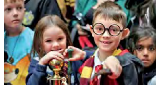
In previous years Kings Cross train station in London has welcomed fans like these to celebrate the occasion.

The organisation also apologised to Potter fans. “We’re sorry some Harry Potter fans were left disappointed on Sunday because they weren’t aware of Warner Brothers’ online celebrations to wave off the Hogwarts Express, which was announced back in July.”