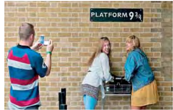
Platform 9 3/4 is a popular tourist destination for Harry Potter fans.