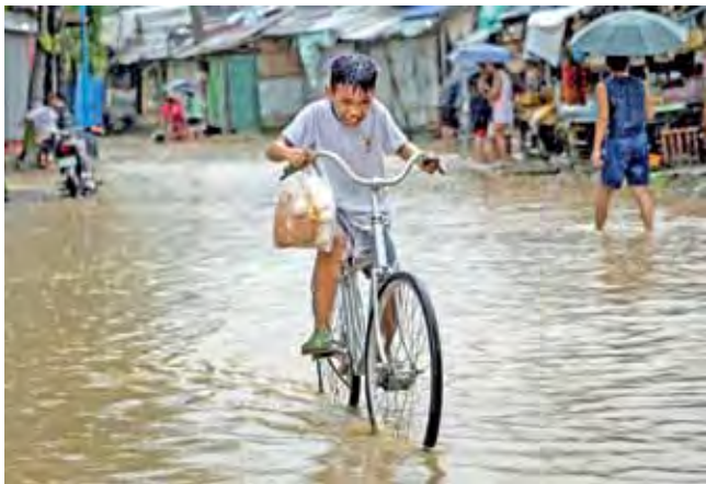
Baras, Philippines A boy carrying a plastic bag with bread and eggs, rides his bike through a flooded road after heavy rains brought by Tropical storm Yagi, locally known as Enteng, in Baras, Rizal province.