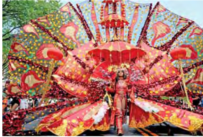
New York, USA A woman in a costume participates in the annual West Indian American Day parade in the Brooklyn borough of New York City.