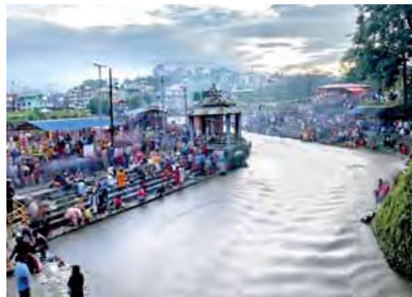
Kathmandu, Nepal People commemorate their deceased fathers at the Gokarneshwor Mahadev temple on the Bagmati River on 'Kushe Aunsi' Father's Day Festival in Nepal.