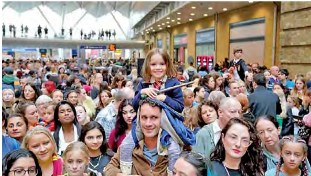
The day attracts Harry Potter fans of all ages to countdown to the announcement.

In July Warner Bros Discovery, who own the Harry Potter franchise, put out a statement asking fans to avoid travelling to Kings Cross.