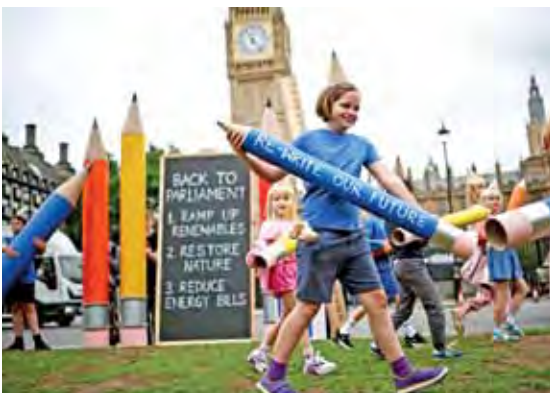
London, UK Children hold oversized pencils bearing messages including 'rewrite our future' during a rally organised by 'Mothers Rise Up' outside parliament.