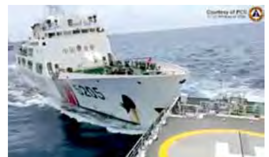
South China Sea Chinese and Philippine coastguard vessels collide near the Sabina Shoal in the disputed South China Sea.