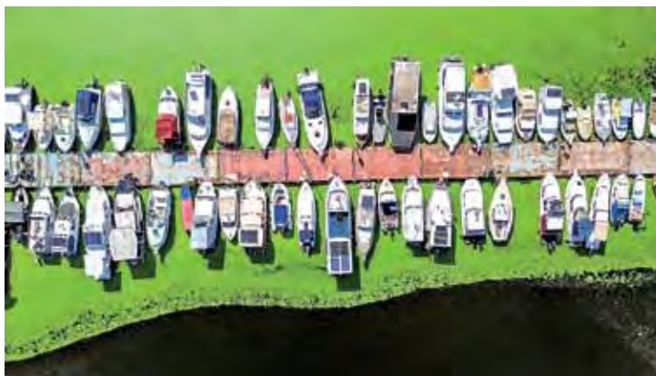
Belgrade, Serbia A drone image shows moored boats in the River Sava's inlet, where water has been covered with algae that thrive in warm and polluted environments.