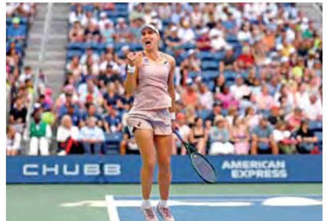
New York, USA Brazil's Beatriz Haddad Maia reacts during her Round of 16 Match against Denmark's Caroline Wozniacki at the US Open.