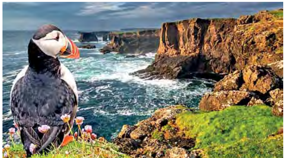
Five more seabird species are now on the red list.

The update has been carried out by a group of the UK’s leading bird conservation organisations. It follows the recent assessment of 28 seabird species.