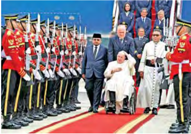
Jakarta, Indonesia Pope Francis is welcomed during his arrival at Soekarno-Hatta International Airport for the first stop of a four-nation tour of the Asia-Pacific region that will be the longest of the 87-year-old's papacy.