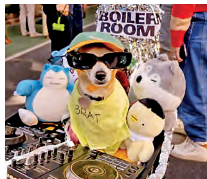
This pup is ready for 'Brat' dog summer!