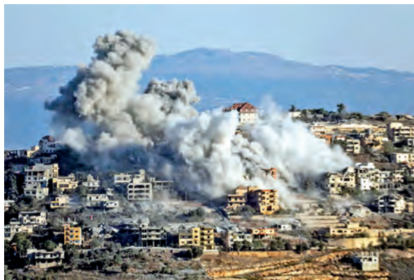
Marjayoun, Lebanon Smoke billows over Khiam after Israeli strikes, amid ongoing hostilities between Hezbollah and Israeli forces, as pictured from Marjayoun, near the border with Israel, Lebanon.