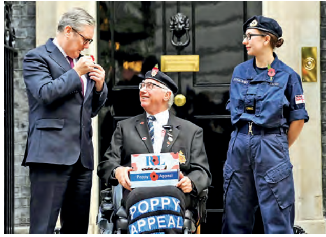
London, UK British Prime Minister Keir Starmer purchases a poppy pin, as he meets with fundraisers from the Royal British Legion ahead of Remembrance Day, outside 10 Downing Street in London.