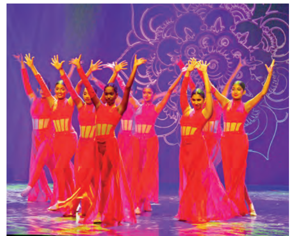
'What was I made for' – a journey of dance through the spectrum of emotions, presented by The Dance Lab was held at the Bishop's College Auditorium on October 7, 2024.