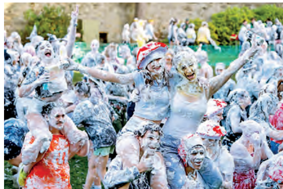
St. Andrews, UK Students take part in the traditional Raisin Monday foam fight on Lower College Lawn at the University of St. Andrews in Fife. The messy display is the culmination of a weekend of festivities in which the first years say thank you to their more senior student 'parents' for mentoring them.