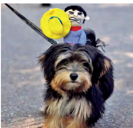
This tiny pup is the finest steed this cuddly cowboy has ever had!