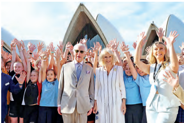
Sydney, Australia Britain's King Charles and Queen Camilla pose for a photo with students at the Sydney Opera House in Australia.