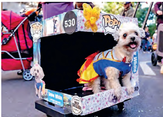
This pooch is posing as a 'Pop' figure!

Happy Howl-o-ween! Take a look at these spooky pups celebrating Halloween with their owners by taking part in a big fancy dress parade.