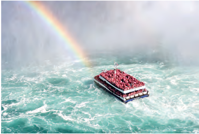
Ontario, Canada A rainbow appears as people enjoy a warm afternoon on a tour boat at Niagara Falls.