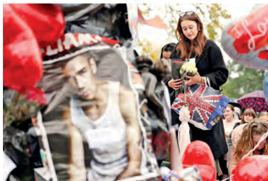
London, UK A fan reacts as she and others pay tribute to former 'One Direction' singer Liam Payne, who was found dead after he fell from a third-floor hotel room balcony in Buenos Aires, Argentina.