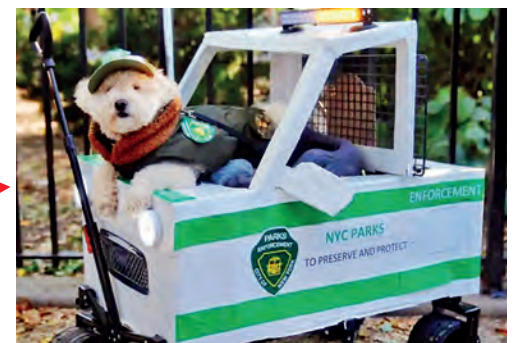
This pup dressed for duty as a park enforcement officer.