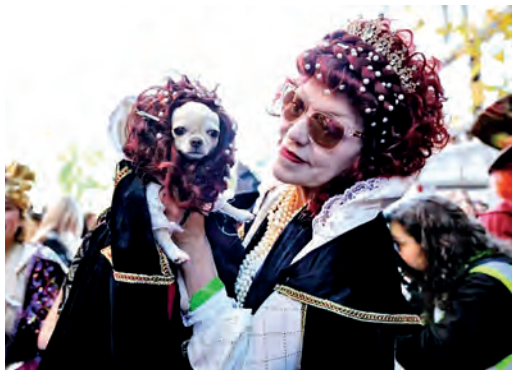
This regal pup and owner dressed up in their royal finery for the parade.