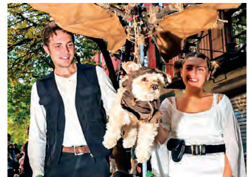
These dogs owners engineered a special harness for their pooch, so it could 'fly' dressed as an Ewok from the 'Star Wars' movie series.