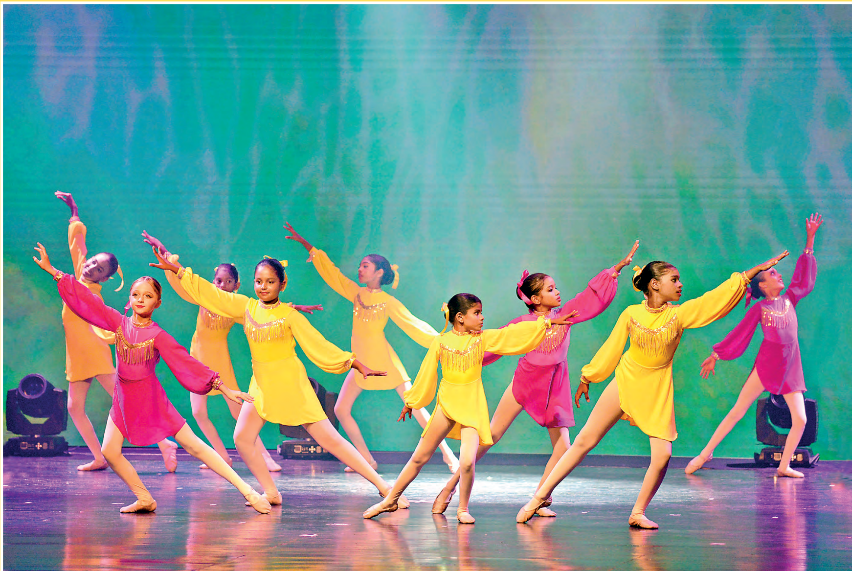
Young dancers of 'Dance Lab'