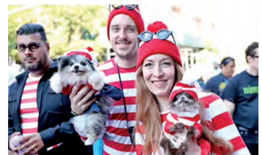
These pups and their owners dressed up as 'Where's Wally' from the children's books.