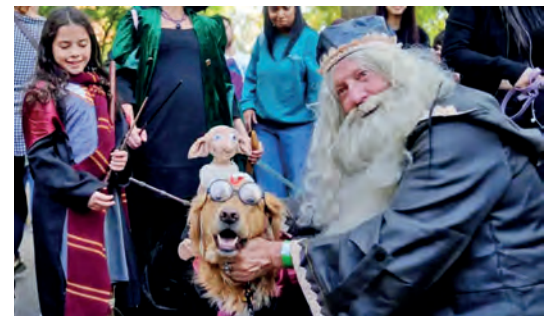
This pooch and owners dressed as characters from 'Harry Potter'. Woof-guardiamleviosa!