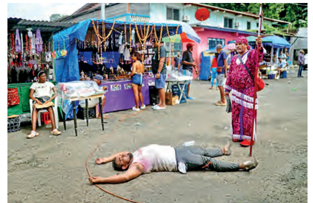
Portobelo, Panama A devotee rests during a pilgrimage to the Cristo Negro de Portobelo, a wooden statue of Jesus, on the path to San Felipe church.