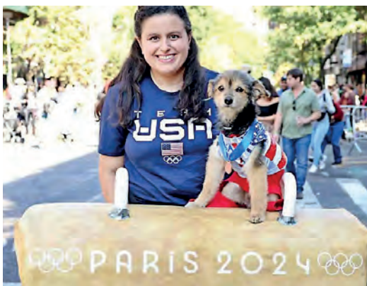
This pup and owner dressed up as the US gymnastics team from the Paris Olympics.