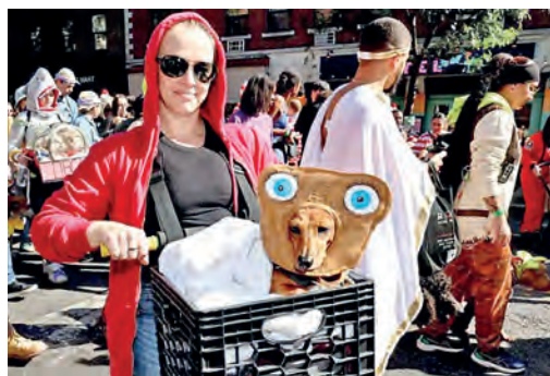
This pup and owner dressed up as characters from the famous alien movie 'E. T.'