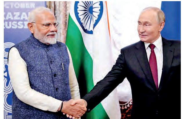
Kazan, Russia The Russian president, Vladimir Putin, shakes hands with the Indian Prime Minister, Narendra Modi, during their meeting on the sidelines of the BRICS summit.