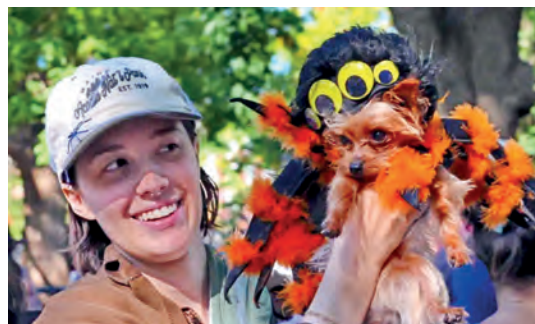
This pooch dressed up as a tarantula.