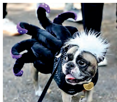
This little pup is dressed as the sea witch Ursula from the Disney movie 'The Little Mermaid'.