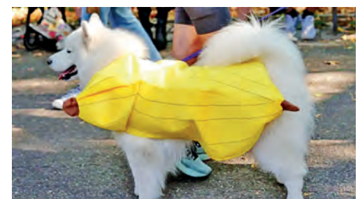
BANANAAAA! This pup would be popular with the 'Despicable Me' minions.