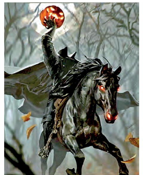
THE LEGEND OF SLEEPY HOLLOW

The first popular story revolving around Halloween was Washington Irving's short story, 'The Legend of Sleepy Hollow', published in 1820.