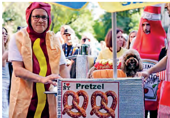
These guys made a New York-style food cart and dressed their pooch up as a hot dog!