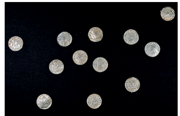
London, UK Part of the Chew Valley hoard of 2,584 coins, dating from around the Norman invasion of Britain in 1066, displayed at the British Museum. The hoard has been valued at £4.3m.