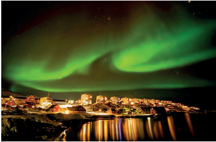
Nuuk, Greenland The Northern Lights appear over the island's capital.