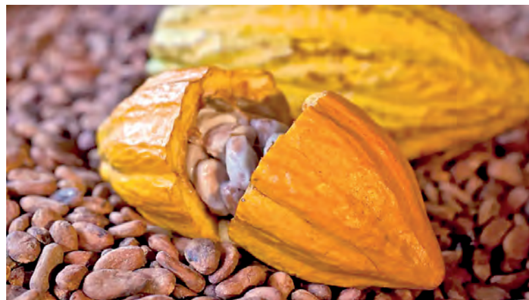
The pods are picked from the trees and opened to get to the cacao beans inside.

Prices of cocoa around the world surged by 136% between July 2022 and February 2024, and the report says these increasing temperatures are partially to blame.