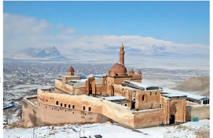
Agri, Turkey An aerial view of the snow-covered Ishak Pasha Palace, one of the most important Ottoman monuments in Anatolia.