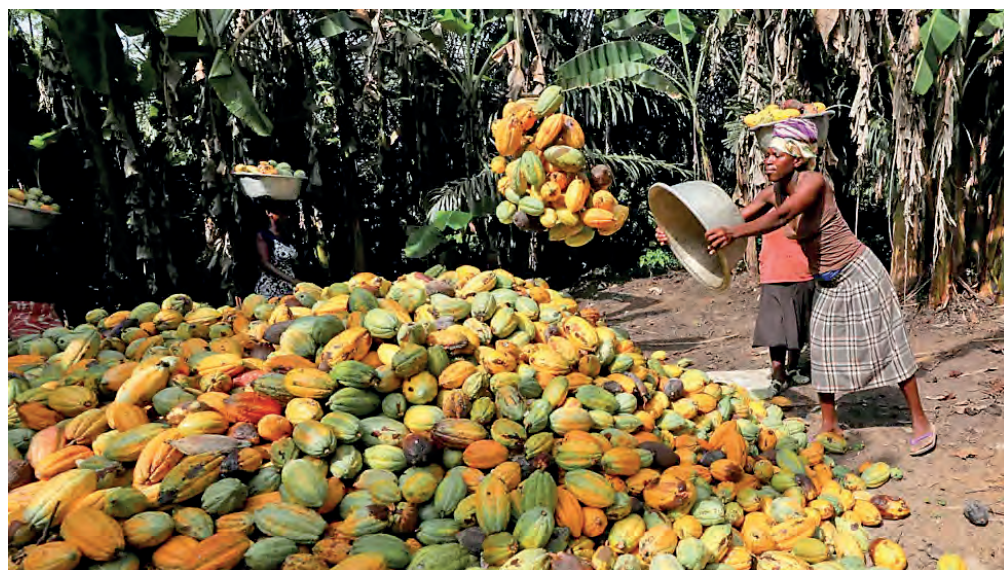
Cacao farmers are being impacted by the high temperatures.

Christian Aid noted that the rising prices of cocoa is having a negative effect on the farmers responsible for its production.