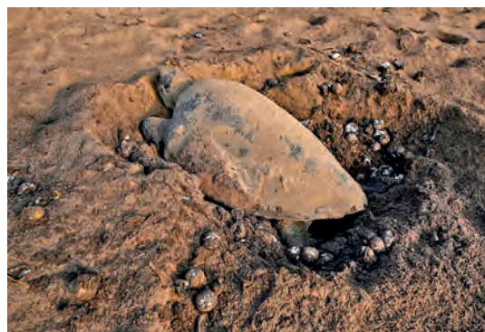
Odisha, India An Olive Ridley turtle lays eggs as the mass nesting of the turtles begins on Rushikulya beach in Ganjam district in the eastern state of Odisha, India.