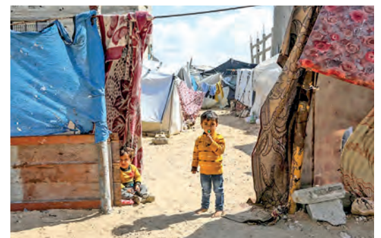
Khan Younis, Gaza A Palestinian boy wanders between makeshift shelters for displaced people.