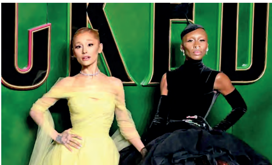
Ariana Grande and Cynthia Erivo missed out on big acting awards.

"It's very overwhelming, this whole thing," he said. "You win the award and then you have to talk to loads of people, feeling very shiny."