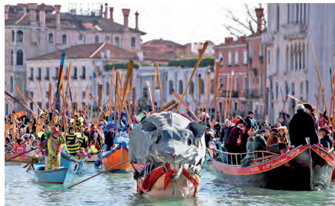
Venice, Italy A boat carries "Pantegana", the big rat, as revellers row during the masquerade parade on the Grand Canal during the Venice Carnival.