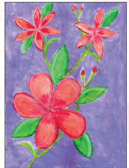
Suthan Thiya (Grade 6) Hindu Ladies' College