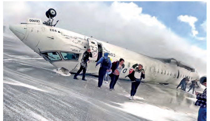
Ontario, Canada Passengers leave a Delta Air Lines CRJ-900 jet after it crashed on landing at Toronto Pearson International Airport in Mississauga, Ontario.