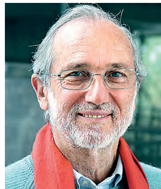
Architect Renzo Piano