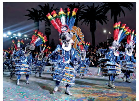
Arica, Chile Dancers take part in the 2025 Con La Fuerza Del Sol Festival.