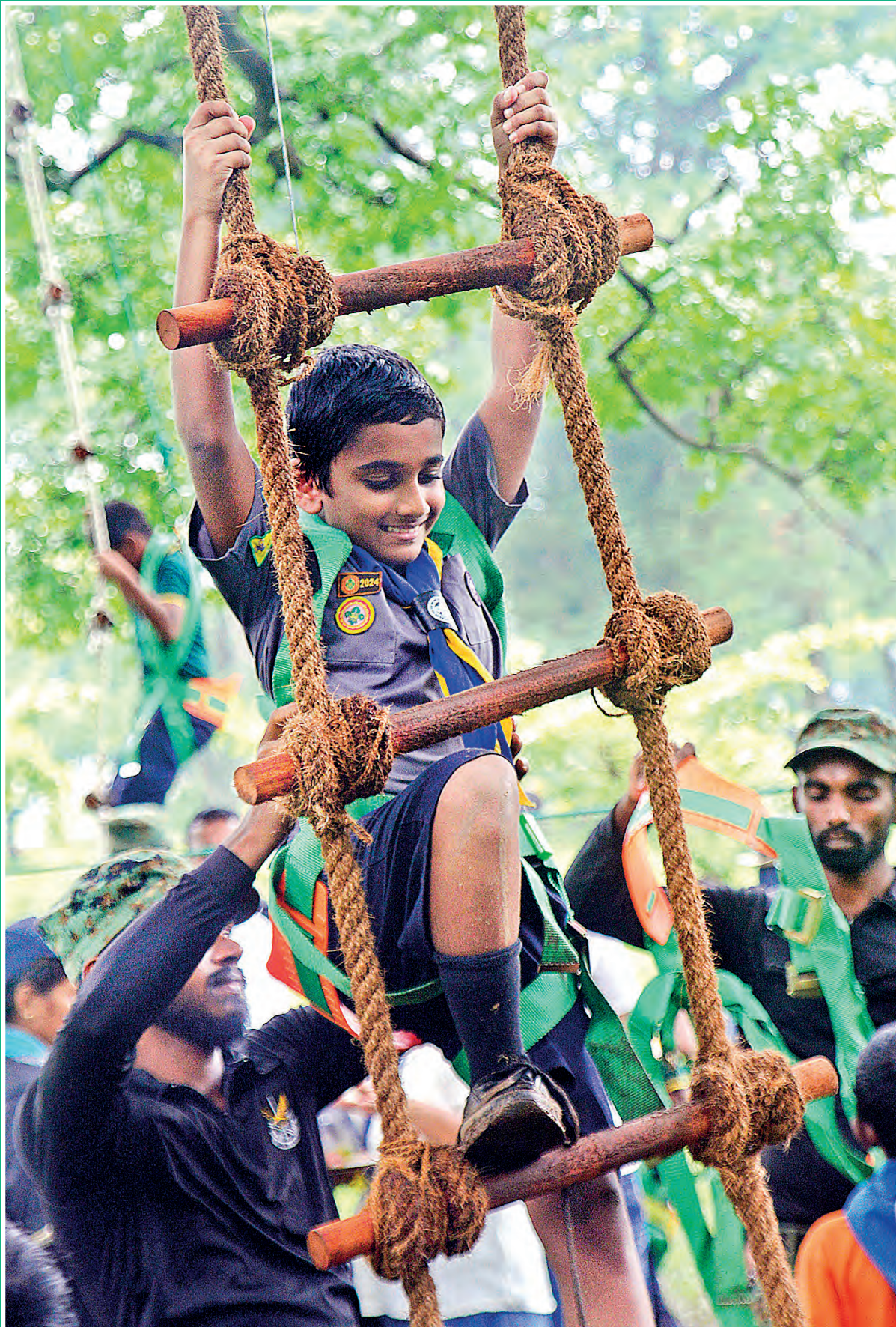
At a Scout Camporee