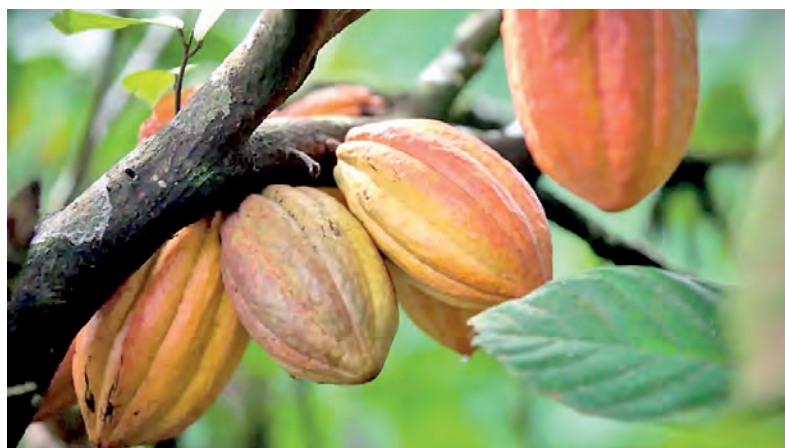
32 degrees Celsius is the optimum temperature for cacao to grow.

Chocolate all starts with the cacao plant.