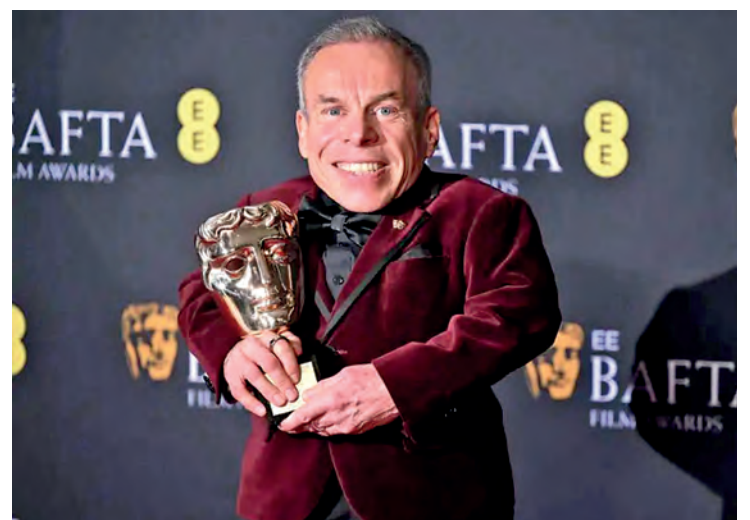
Warwick Davis won the Lifetime Achievement award.