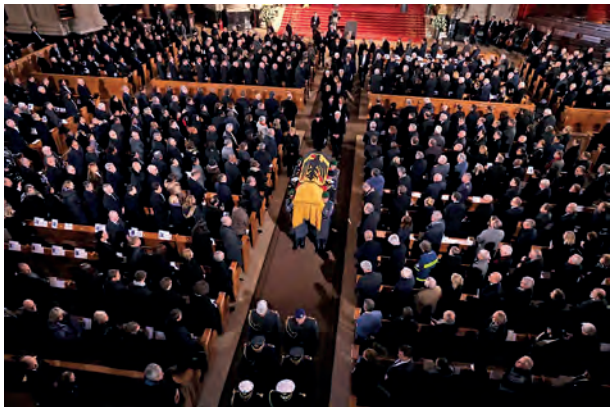
Berlin, Germany A state memorial service for the former German President Horst Köhler takes place at the city's Dom Cathedral.