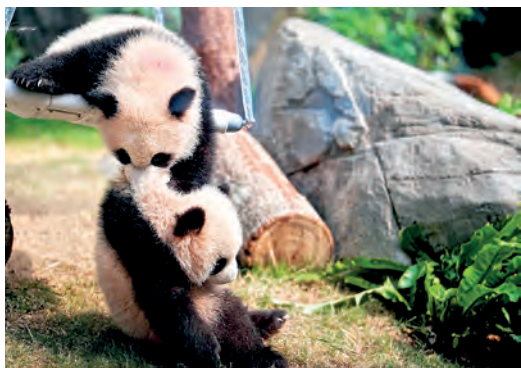
Hong Kong, China Panda cubs play during a debut ceremony for the 6-month-old twin panda cubs, at the Ocean Park in Hong Kong.